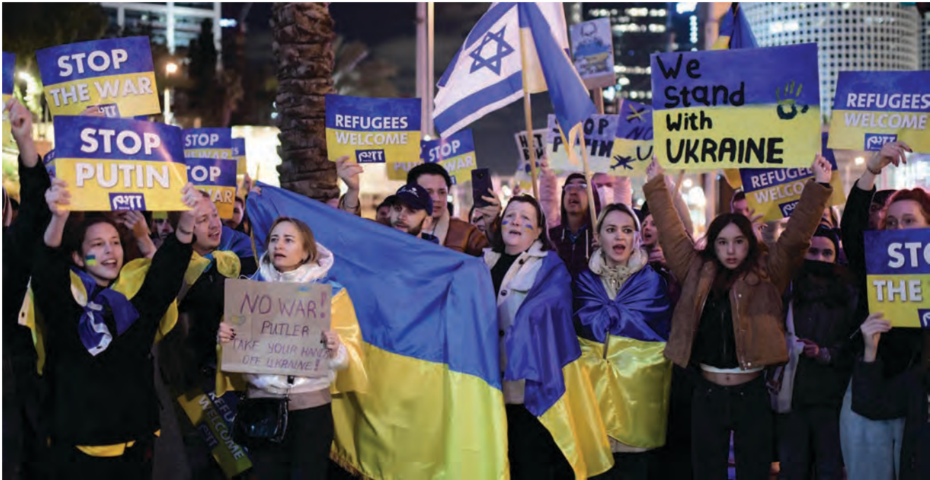
Demonstrators carry placards and flags during a protest against the Russian invasion to the Ukraine, in Tel Aviv on 12 March 2022.

Another Ukraine-Palestinians analogy currently making the rounds has to do with the suffering of civilians. This allegation gained currency in social media this week,