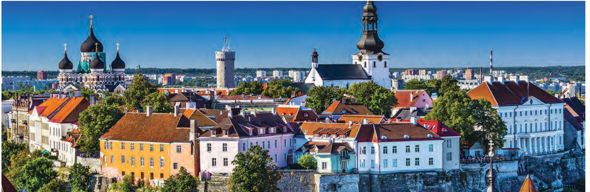
Tallinn, Estonia at the old city.