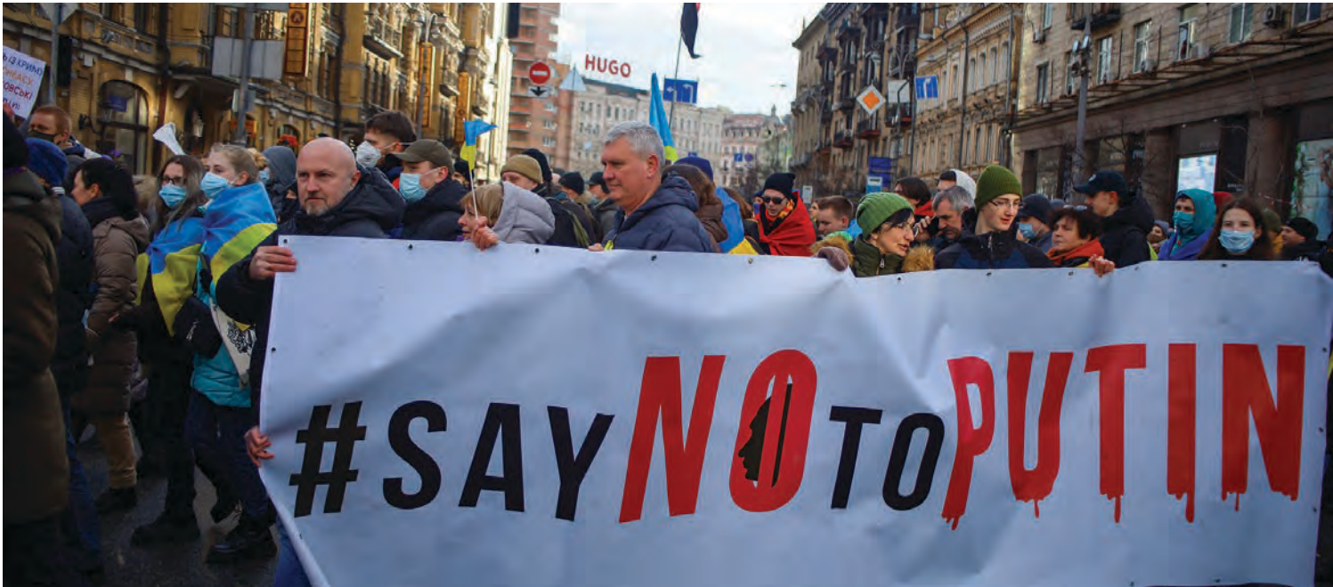
12 February 2022: March of Ukrainian protesters against Russian aggression in Kyiv, Ukraine.