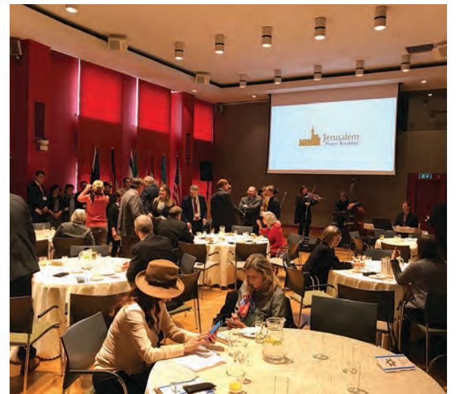
Entertainment during the Jerusalem Prayer Breakfast.

Over the years the Jerusalem Prayer Breakfast has already been held in several cities around the world. The main gathering is held yearly in June in Jerusalem and is attended by about 500 people.