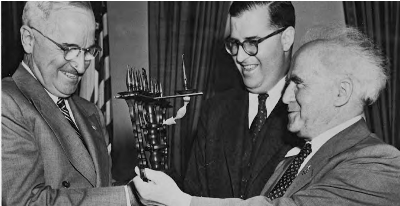
Prime Minister David Ben Gurion accompanied by Mr Abba Eban, Israel Ambassador to USA visits President Harry Truman, 1951.

given the task of recruiting members of the Jewish population for the British army. Although the British wanted him to continue to serve in their forces after the war, with the horrors of the Holocaust now becoming known, Abba Eban joined the Jewish Agency instead and dedicated his life to Zionism. In Israel, he invested his time in writing and in public speaking, becoming very involved in Israeli politics. Fluent in Arabic, he was always given the task of talking to Arabs. His British accent and exterior were a bonus to him and his country. Just like at the UN, both the Israelis and the