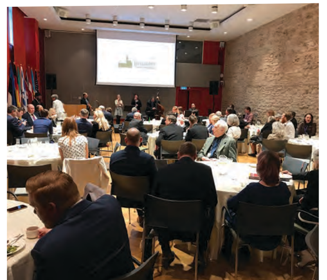
During the conference at the Jerusalem Prayer Breakfast.