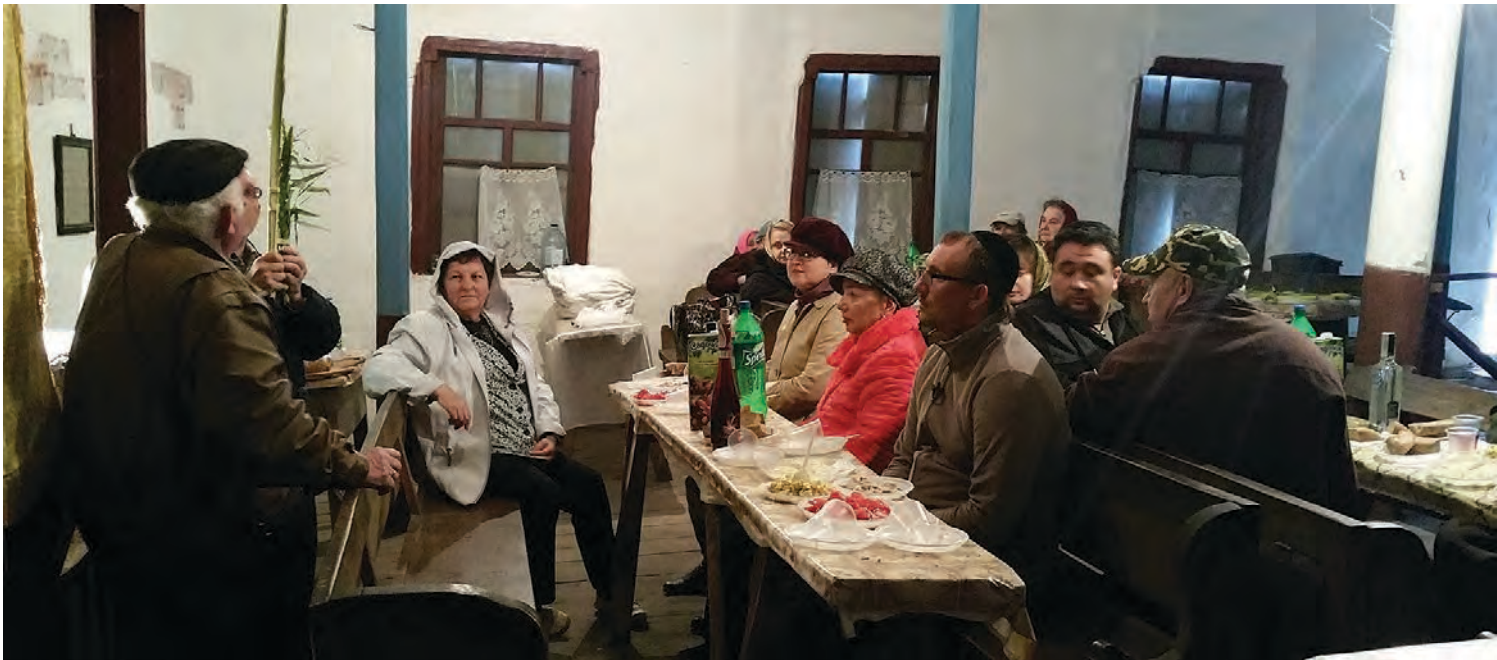
Meeting in the oldest clay synagogue in Europe in Bershad (Ukraine).