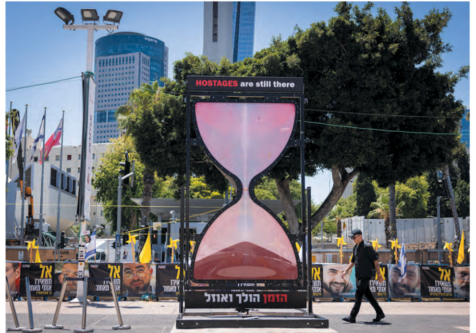
Hostage Square in Tel Aviv.

Hamas has control in Gaza at three levels: as a military army, as a guerilla organisation, and as thugs using brute force to keep control of the Gaza civilian population. Israel's army has achieved success in destroying Hamas at the first level, but not at the second and third levels. Destroying Hamas' capabilities to fight guerilla warfare is almost impossible to achieve (ambushes on IDF soldiers in the north of Gaza show that Hamas is strongly armed, and still able to carry out effective guerilla