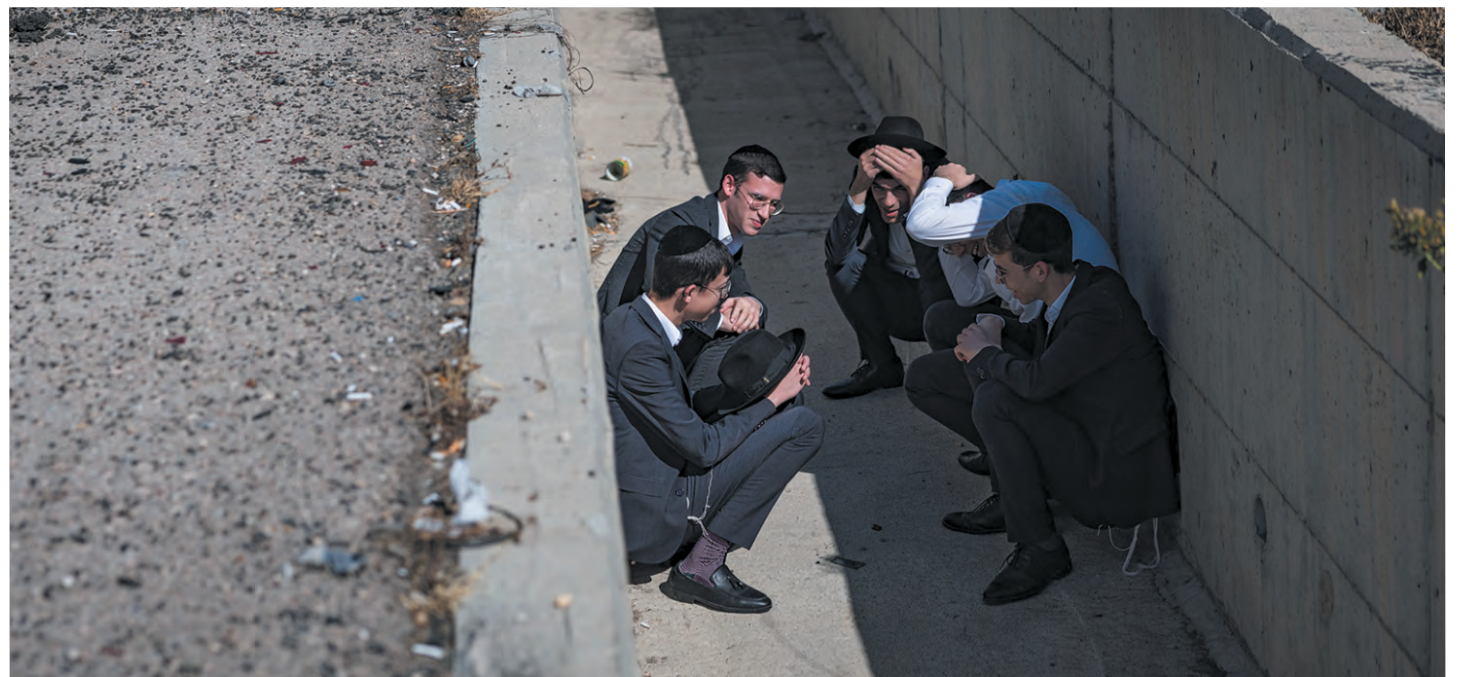
People take cover as siren warns of incoming missiles fired from Iran, on Road number 1 between Tel Aviv and Jerusalem, 15 June 2025.

To cast doubt upon the prudence of the Israeli strikes, journalists speculated that loads of highly enriched uranium were evacuated by trucks photographed at Fordow facility before the bombing, but it's puzzling that the reports assumed the Israelis failed to follow those trucks. Others questioned the effectiveness of killing Iran's top nuclear weapons scientists because their knowledge could have been passed on, but they ignored