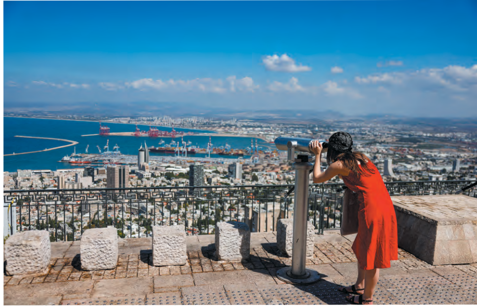
View on Haifa.

Haifa is a multicultural city woven together by the threads the new Israeli culture. At its port, ships are loaded and unloaded during the day, and at night dozens of trucks with heavy containers leave for Jordan and even Saudi Arabia.