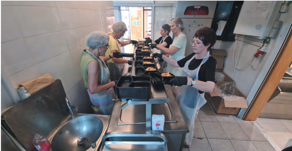
Soup Kitchen Hineni provided hundreds of extra meals because of the War.

Thanks to the generosity of supporters like you, Christians for Israel was able to respond swiftly in June—and through our partners we were able to provide food to soup kitchens, provide shelter for traumatised children, and now help begin the restoration of damaged homes and schools. Your support is still needed. Together, we can continue to stand with Israel during this critical time. Your gift brings practical help and a message of hope. Thank you for your prayers, your compassion, and your unwavering support.