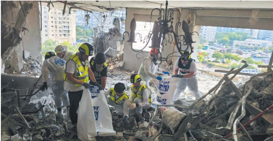
ZAKA employees provide first aid at the sites where rockets from Iran have struck.