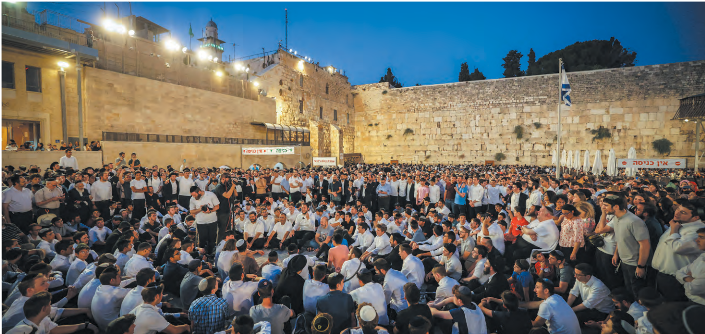
Jews gather at the Western Wall in the Old City of Jerusalem, at the end of Tisha B'Av fast, on 13 August 2024.

Renewal Joy cannot be complete until Jerusalem