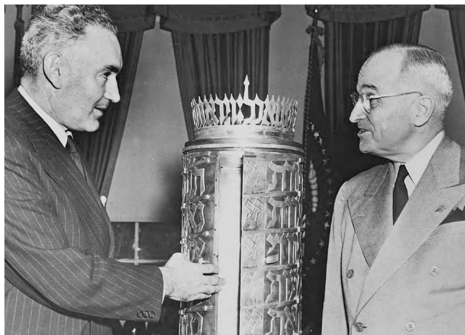
Israeli Ambassador Eliahu Elath presents President Truman with a silver ark for the Scrolls of the Law, a gift from President Weizmann.

The British Government advised the UN that it would end its mandate at midnight on 14 May 1948. If there were