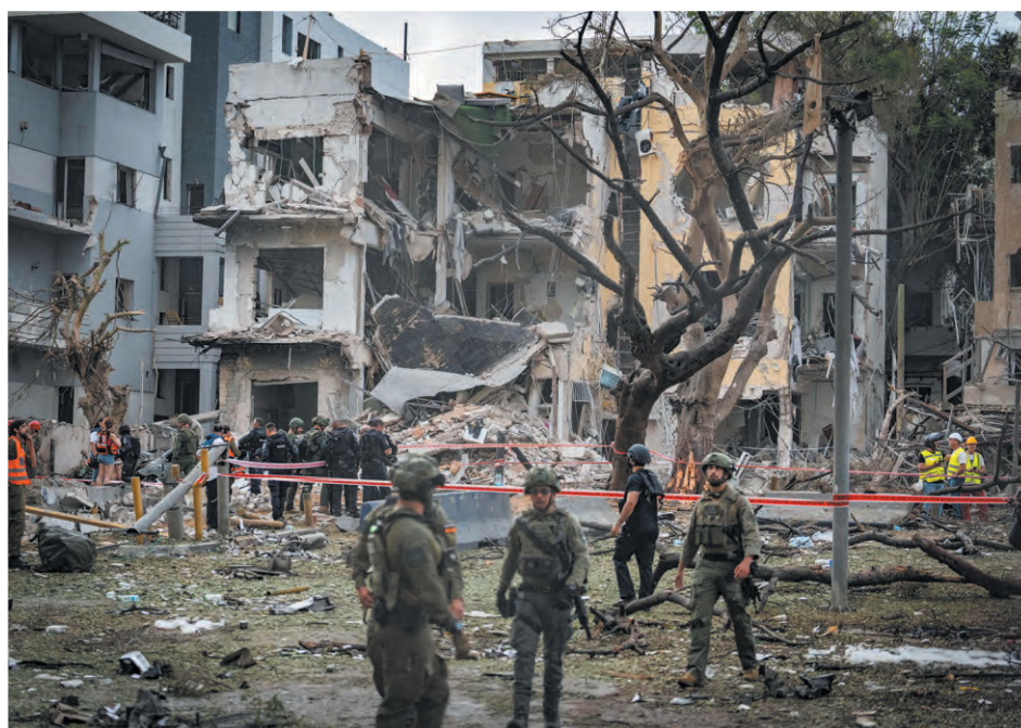
The scene where a missile fired from Iran hit and caused damage in Tel Aviv, 16 June 2025.

The 'bunker buster' bombs used by the US were GBU-57 series MOP (Massive Ordnance Penetrator)—a 30,000-pound (14,000 kg) class, 20.5-foot-long (6.2 m) precision-guided missile developed by Boeing for the US Air force, composed of a BLU-127 bomb body and an