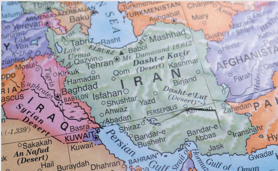
Map of Iran.

Salman Rushdie in 1988, and leading Shia forces in the Iran–Iraq War (1980–88), cemented his status as both a spiritual icon and a symbol of anti-Western resistance in Iran. Ayatollah Khomeini’s successor, the former 3rd President (1981–89), and 2nd ‘Supreme Leader’, Seyyed Ali Hosseini Khamenei (b. 1939), is also a ‘Twelver Shia’ marja’ (Lit. ‘source to follow’). Khamenei has continued both in style and content the 1979 Islamic Revolution, in which 98% of Iranian voters backed a radical shift from the pro-Western/pro-US orientation of the last Shah to a new, ultra-conservative Islamic Republic. Though many in Iran today chafe at its radical Islamism few question the rationale for the Revolution. Monarchists are few and far between. The Iranian regime’s theocratic vision is rooted in ‘ Velayat-e Faqih ’—‘Guardianship of the Islamic Jurist’—which combines Shia authoritarianism with a militant drive to dominate the Arab world, destroy Israel, and oppose Western influence. To outsiders—including many Muslims—the oppressive theological and socio-political ethos of the Iranian regime remains an opaque, elitist, dangerous ideology intolerant of dissent and confident of its own rectitude. Critics condemn themselves for heresy.