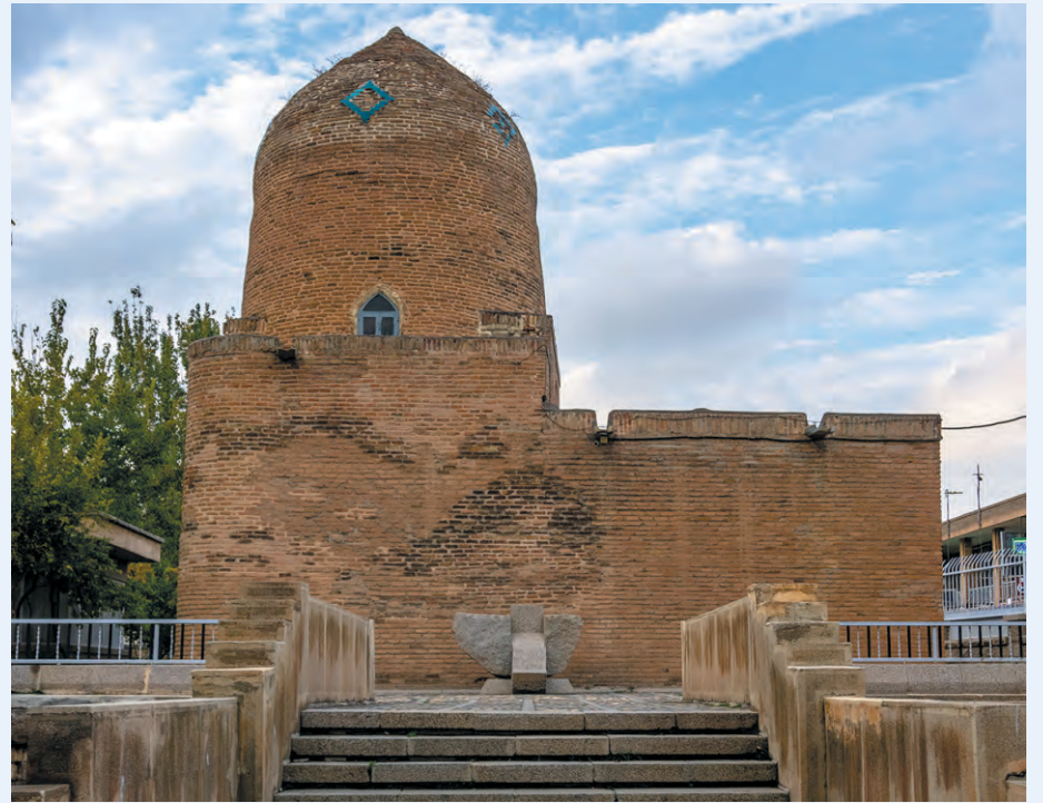
The traditional Tomb of Esther and Mordechai in Hamadan, Iran.

In the New Testament, the Wise Men who came with their gifts to worship the baby Jesus were likely to have been Magi, Persian astronomers from Yazd, Southern Iran. These Magi would have been familiar with Old Testament prophecies and were known for studying the heavens to identify changes that would indicate significant events, such as a star! Their recognition of the Messiah's star fulfilled the prophecy in Numbers 24:17: "A star shall come out of Jacob, and a scepter shall rise out of Israel."