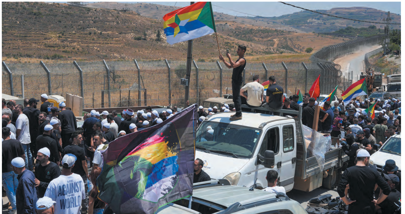
Druze residents protest near the Israeli-Syrian border in solidarity with their community in Syria, in Majdal Shams, 16 July 2025.

“I was just sitting there watching the horror videos, one by one. Just like we all did on 7 October,” he said,