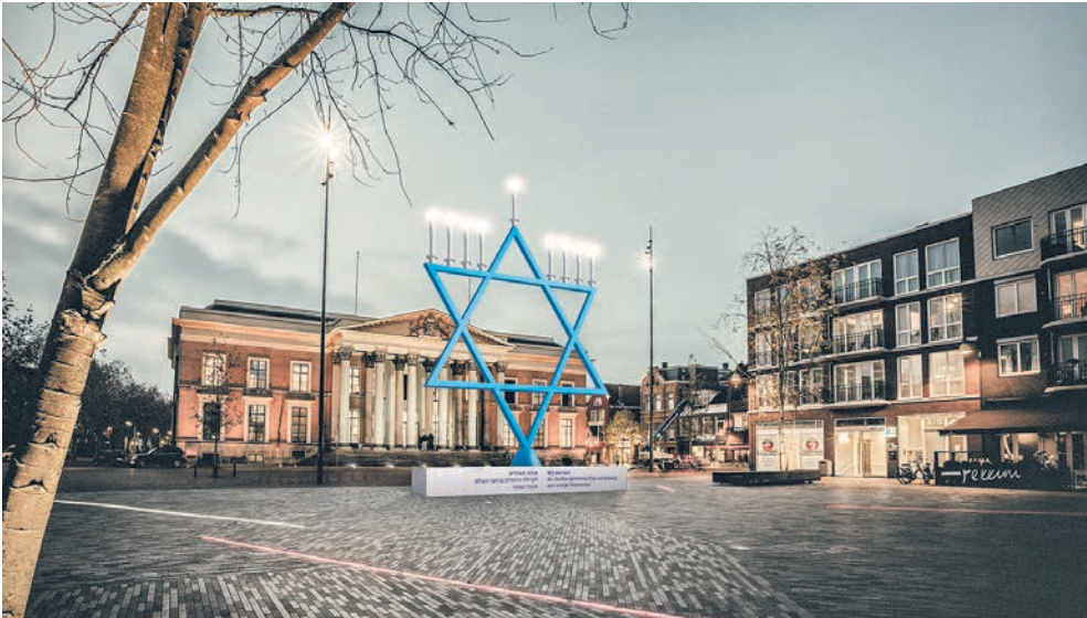
This Menorah, shaped in the form of the Star of David, was built in 2013 by Christians for Israel Netherlands. It is a landmark that illustrates the light that Israel and the Jewish people are to the world, and it symbolises beautifully universal values such as friendship, tolerance and appreciation.