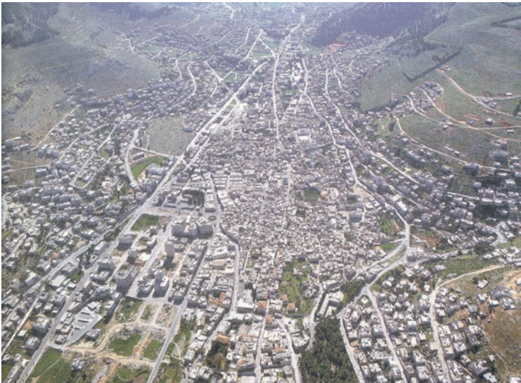
Aerial photo of modern Nablus, showing how the valley is positioned between Ebal (left) and Gerizim (right). | Photo: ramixz/CC3.0 Wikimedia Commons