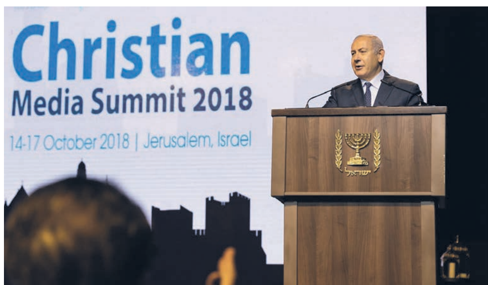
PM Benjamin Netanyahu opening the Christian Media Summit 2018

Truth is under attack, but truth will set people free, and that's our commitment.