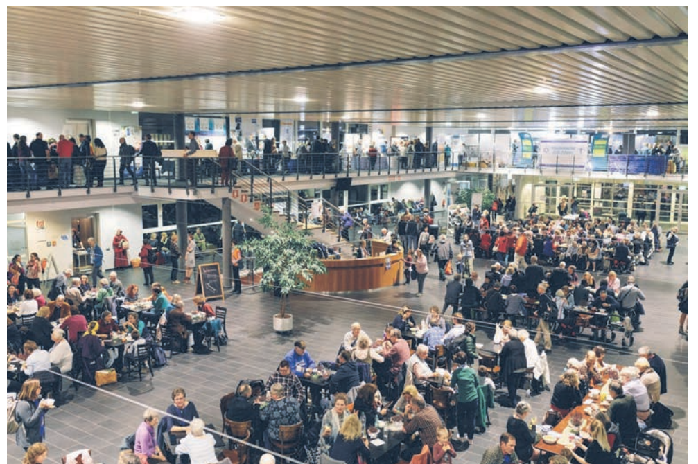
View of the hall where the '3rd Israel and the Church Congress' took place, where approximately 40 Israel-organisations set up their information booths