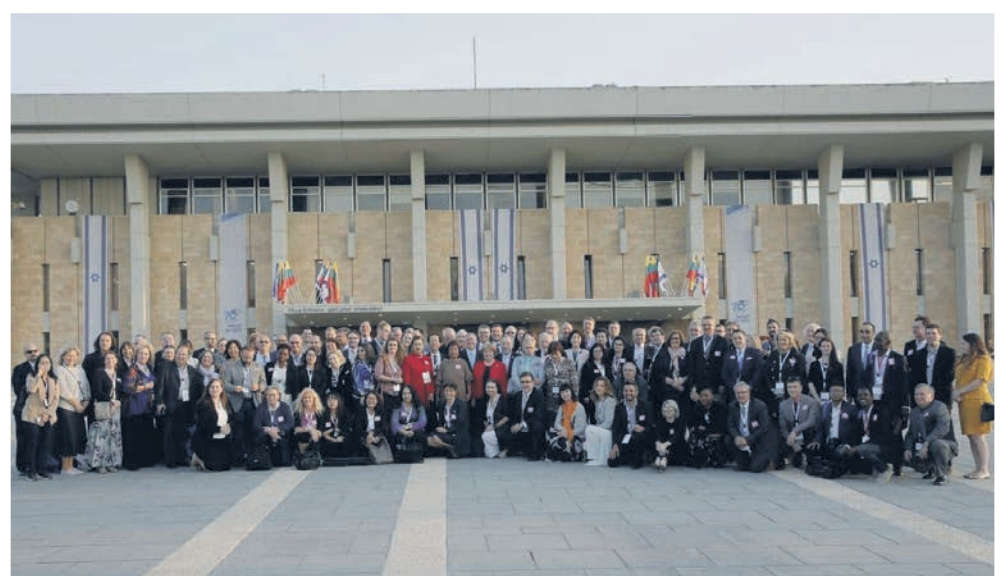
Christian Media Summit attendees outside the Knesset