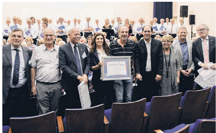
The Jewish Agency awarded Christians for Israel a certificate of honour celebrating the 70th anniversary of the State of Israel and 70 years Aliyah

With all the challenges and difficulties, we are together, praying for the next 70 years, the next 3 million olim we must help and the blessings yet to come. For it is for such a time as this, that we have been waiting for.