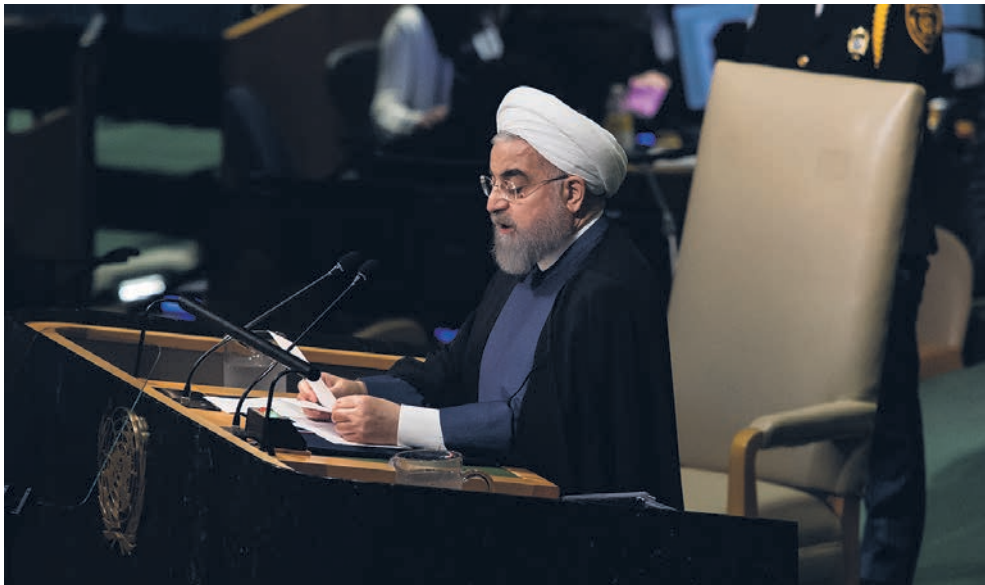
Iran's President Hassan Rouhani addresses the 72nd session of United Nations General Assembly at the UN headquarters, in New York, USA

The Meir Amit Intelligence and Terrorism Information Center in Israel revealed mid-November that Iran – via Hezbollah - had delivered the Kornet missile which was used to open the offensive against Israel