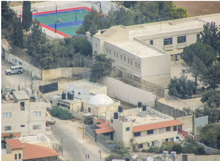
The tomb of Joseph (the building with the dome) is nowadays located in between modern buildings.

I often visit near the site of Joseph’s tomb, in the so-called ‘soldiers café’, where soldiers sit in front of the television with coke after their patrol of the neighbourhood. I stand outside the café and I look around thinking: this is where Jesus was. Close to the field of Joseph He had that special encounter with the Samaritan woman, at Jacob’s well. She pointed him to the sanctuary of her people at the Gerizim and Jesus revealed who He was. His disciples were buying bread and heard that the fields were ripe for harvest ( John 4 ). It is an encounter that is so reminiscent of the history of Joseph: the bread, the fields of grain, the well, the revelation: It is me! Jesus, the Son of Joseph, walked here and I never imagined the surroundings looked like this: the mountains, the hills and the valley where the farmers are still growing their grain.