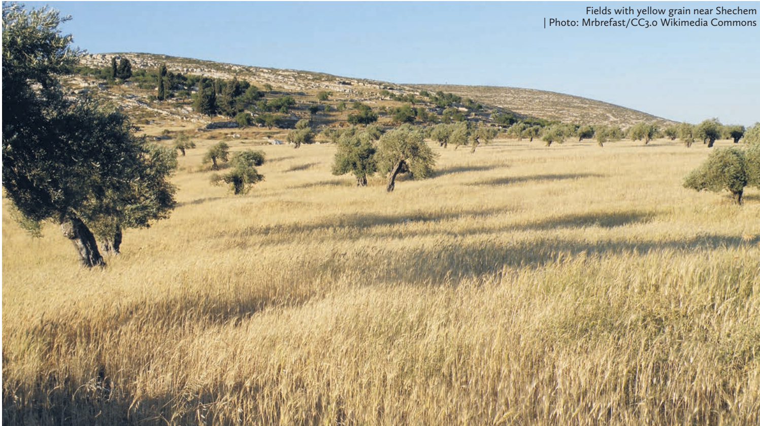
Fields with yellow grain near Shechem