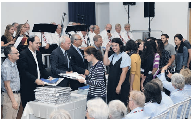
The 70 new olim receive a memento for their Aliyah to Israel