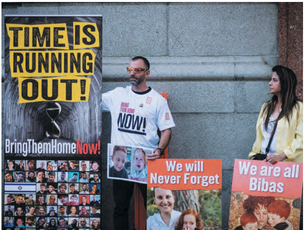
A solemn reminder of those who remain in captivity.