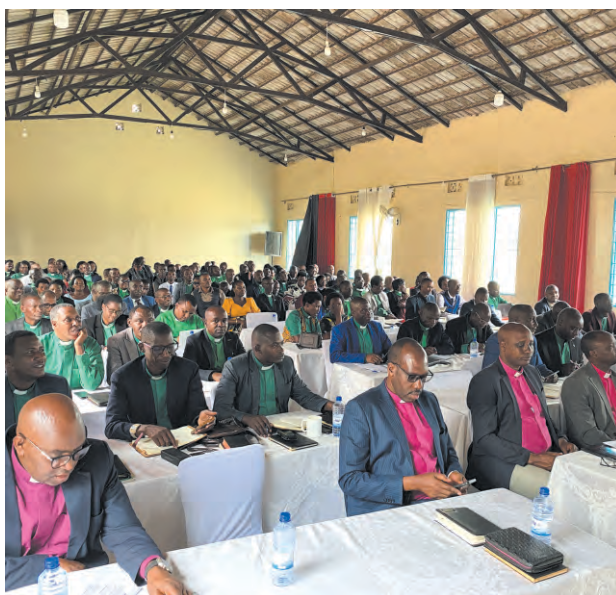
130 pastors of the Presbyterian Church of Rwanda together in Kigali for a full day conference about Israel.