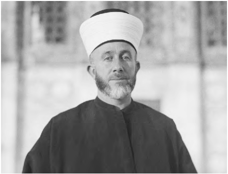
Haj Amin Effendi el-Husseini, the Grand Mufti of Jerusalem.

This included regularly driving donkeys and camels through (at that time) the alley near the Western Wall, forcing Jews to step aside and polluting the pavement. In 1925, British authorities were prompted by Muslim leaders to forcibly remove chairs and benches. And on Yom Kippur 1928, the British forcibly removed a fabric partition between the men’s and women’s sections. On 20 October 1928, praying Jews near the wall were attacked by an Arab mob, during which the British did not intervene. The same happened on 14 August 1929, when the Torah scrolls brought by Jews were set on fire. The outbreak of violence was a result of incitement by notorious anti-Jewish agitator Amin al-Husseini (an uncle of the later PLO leader Yasser Arafat). He had spread the rumour that the Jews wanted to destroy Al Aqsa Mosque, and that the Western Wall was part of the mosque. The disturbances spread across the country and claimed the lives of 133 Jews. The theme introduced by Al-Husseini is used by Muslims to this very day to legitimise anti-Jewish violence.