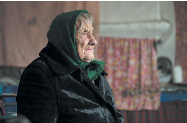
Holocaust survivors in Israel and Ukraine.

For many Holocaust survivors, loneliness adds to their financial struggles. More than half still suffer from the lasting psychological effects of their childhood trauma. The horrific events of 7 October 2023, retraumatised many, leaving them too afraid to leave their homes. With the support of the Café Europa in Jerusalem, lonely survivors can meet weekly for coffee and companionship. For many, the Hineni soup kitchen provides their only meal of the day. We were also able to support impoverished Holocaust survivors in Israel and Ukraine—through home visits, food assistance, and essential aid including medicine, glasses, and hearing aids. Your support brings comfort and dignity to those who have endured so much.