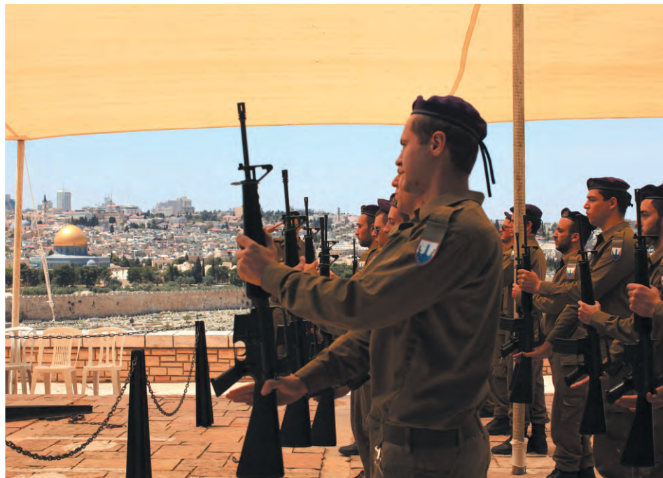
Soldiers practice an honour guard salute as they prepare for Israel's Memorial Day services.

positive was the new State of Israel kept the UN's Partition Plan area, yet also gained almost 60% of the area proposed for an Arab state (that the Arabs rejected).