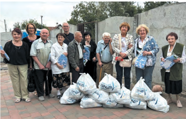
Food parcels and emergency aid.

Our team in Ukraine continues to provide critical support and your support made this life-saving work possible in 2024. Our dedicated C4I team delivers food parcels to those in desperate need across the country and visits Holocaust survivors to offer comfort and assistance. For those seeking to make Aliyah , we help them to our shelter in western Ukraine and then help them cross the Moldovan border, where they are transported to the consulate and airport in Kishenov to begin their journey to Israel.