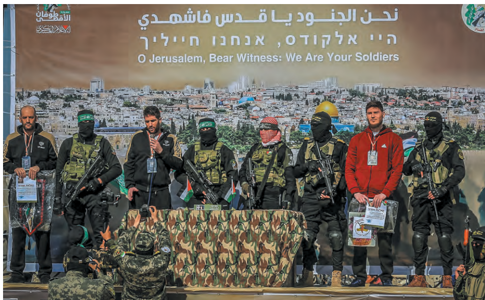
Al-Qassam Brigades hand over Israeli hostages to the Red Cross, as part of the ceasefire agreement between Israel and Hamas, 15 February 2025.

Despite the fall of its key ally, Bashar al-Assad in Syria, Iran remains a major security threat, and the situation in Syria has introduced a heightened risk of regional instability and aggression against Israel. Qatar’s sponsorship of terrorism is highly problematic and should also be addressed.