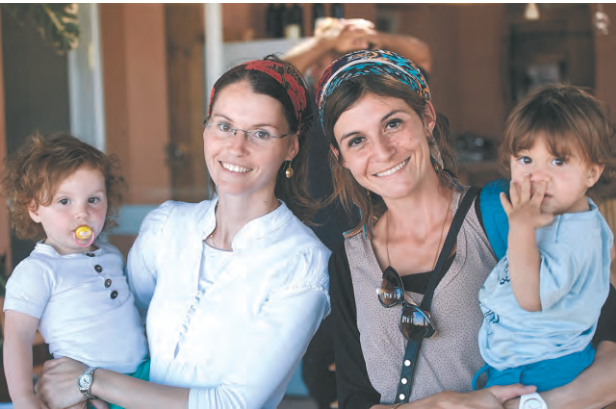
Providing a First Home in the Homeland.

with a welcoming and secure place to begin their new lives. Through this programme, they quickly connect with other families, learn Hebrew, and prepare for their future in Israel—both personally and professionally.