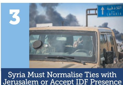
3 Syria Must Normalise Ties with Jerusalem or Accept IDF Presence