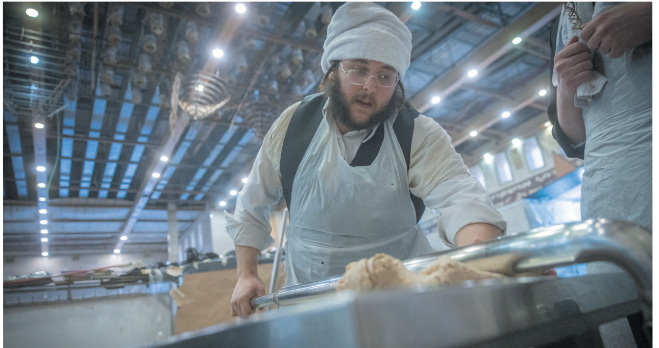
Ultra Orthodox Jews prepare Matza, traditional unleavened bread eaten during the 8-day Jewish holiday of Passover.

Deuteronomy 16 is the last iteration of the cycle of the