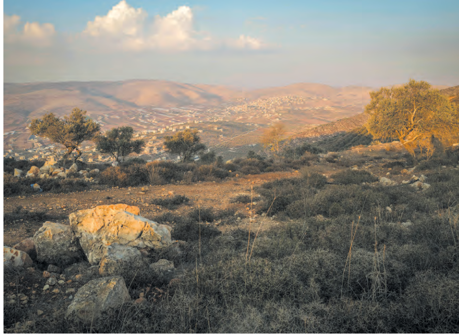
Itamar's hill outposts, Samaria.

Almost no men remained in the community (a very small community, about 25 families, along with a few single residents, close to Arab villages) leaving it practically defenseless. One could say that we left to defend the State of Israel, but in doing so, we essentially abandoned our families. My settlement, like many others, was left almost entirely in the hands of women. Very few men stayed behind, and the army took time to organise its defense efforts.