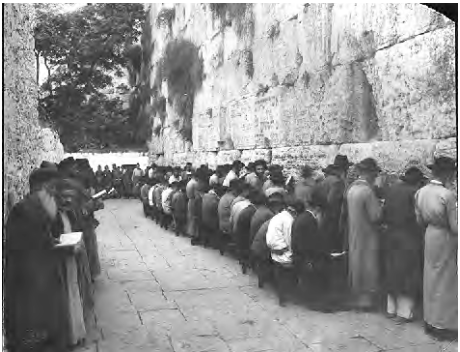
Jews in the alley near the Western Wall, around 1925 (archive photo).