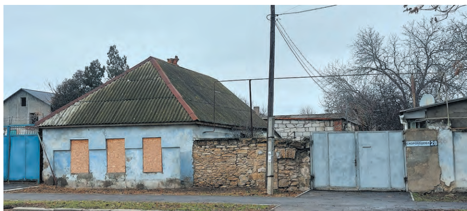
The impact of the war can be seen everywhere in Nikolayev.