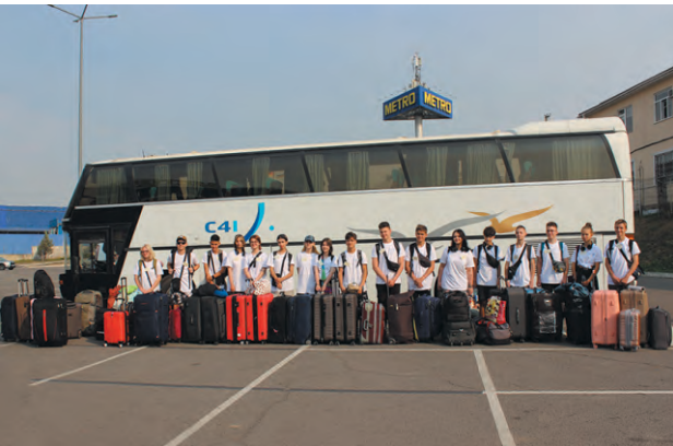
Assistance with Aliyah from various countries.

In 2024 we continued our support of Jewish immigration from Ukraine, Ethiopia, France and other countries. Starting a new life is never easy, which is why we also assist with the integration process in Israel. In 2024, groups teenagers from Ukraine made Aliyah to pursue their dreams and study in Israel. They are determined to complete their education and become active members of Israeli society.