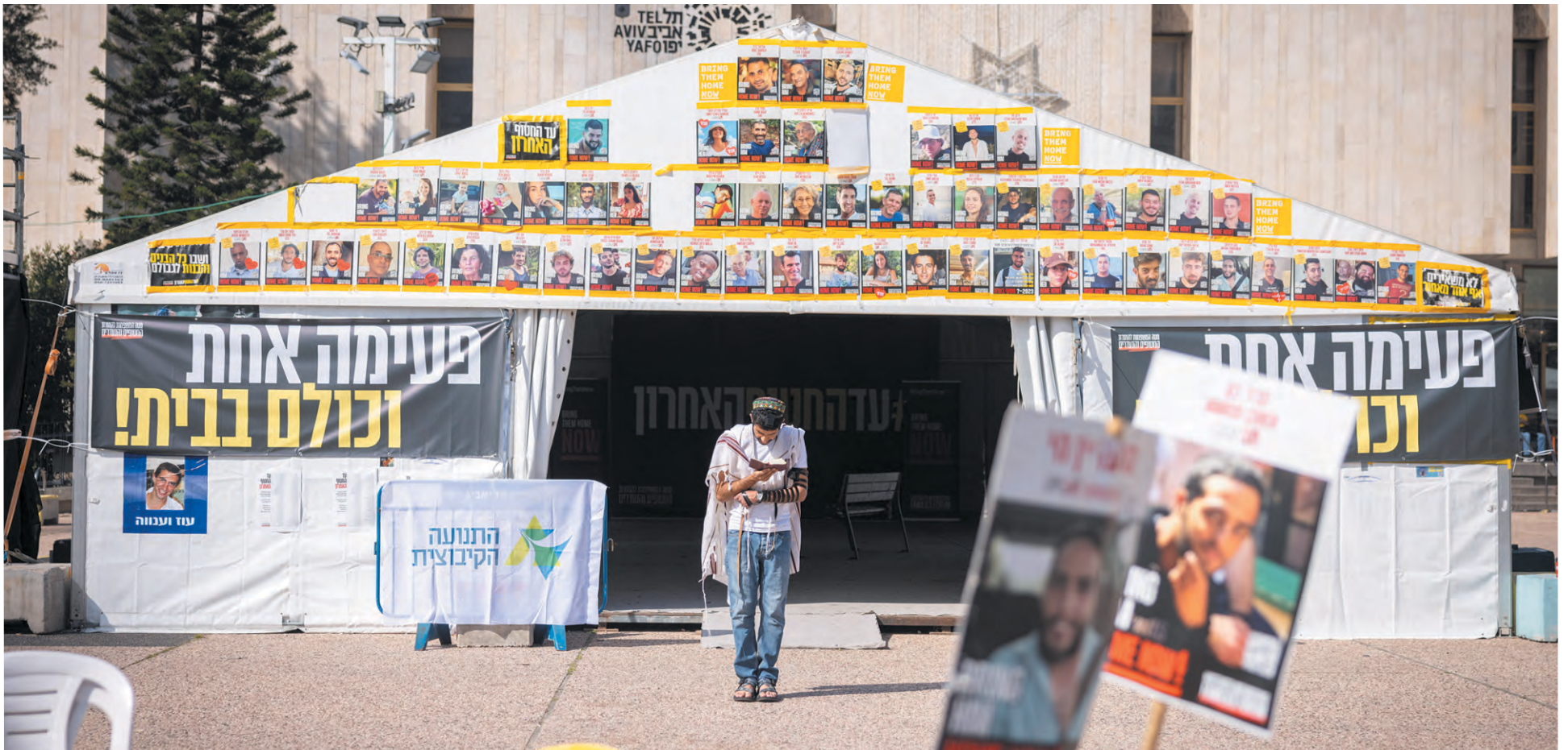
A man praying at Hostage Square in Tel Aviv.