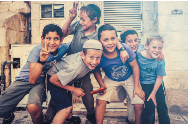
Jaffa Institute, a home for children at risk.

The Jaffa Institute provides vital support for children who have been left without care because their parents can no longer provide for them. Through the Jaffa Institute, they receive not only food and education but also the warmth, guidance, and encouragement they need to build a brighter future.