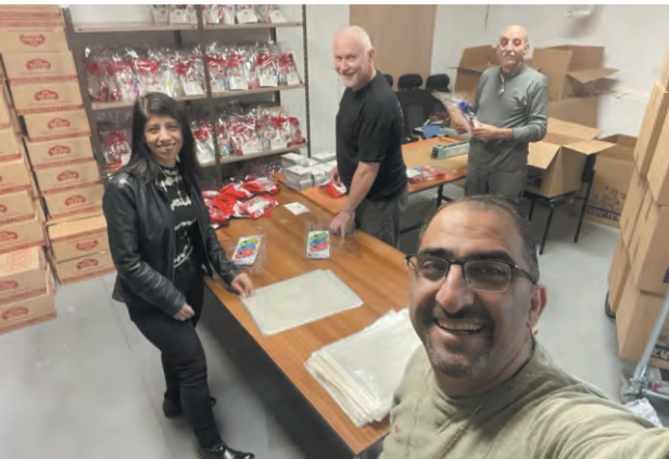
Help to Arab Christians in Bethlehem and Nazareth.

Thanks to your donations, it was possible to organise a summer camp for the children of the First Baptist Church in Bethlehem. Additionally, we provided clothing, food, and small Christmas gifts to families in Bethlehem and Nazareth.