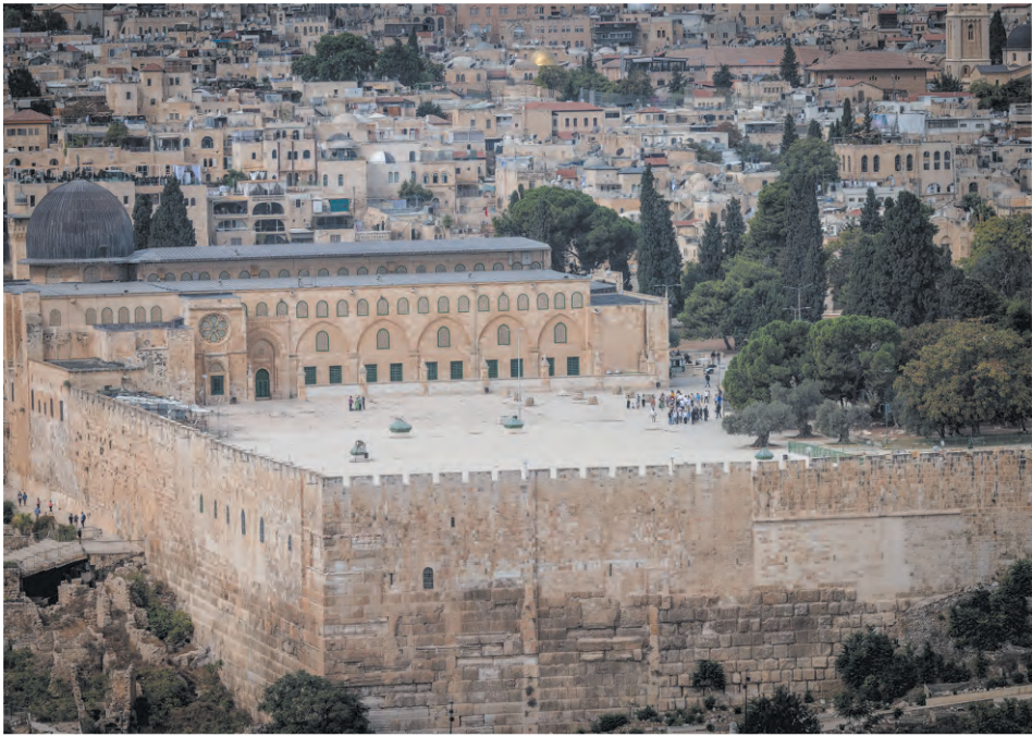
The Al Aqsa Mosque on the Temple Mount.

“May it be Your will, Adonai, our God, and the God of our Fathers that the Holy Temple be rebuilt speedily in our days, and grant us our share in Your Torah. And there we will serve You reverently as in the days of old, and in earlier years. And let Adonai be pleased with the offerings of Judah and Jerusalem as in the days of old and in earlier years.” From the Eighteen Benediction, part of the daily Jewish prayer cycle.