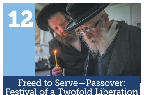
12 Freed to Serve—Passover: Festival of a Twofold Liberation