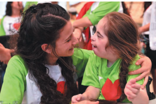
Help to children with disabilities.

ADI provides a nurturing home for children and young people with disabilities in Jerusalem and the Negev. Jewish, Arab, and Bedouin children receive the care, support, and opportunities they need.