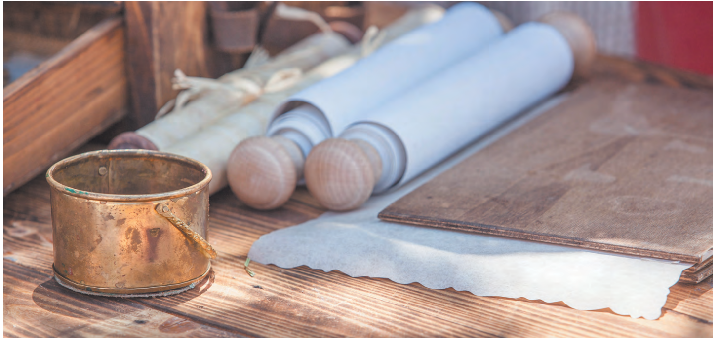
Ancient Roman Writing Instruments

Rabbi Shapira goes into great detail unpacking how the Bible itself appears to have predicted the 7 Oct massacre and what preceded it. Sounds shocking doesn't it? Quite frankly, it is shocking and yet, after reading it, quite obvious.