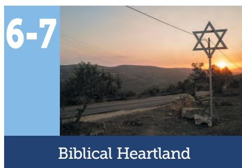
6-7 Biblical Heartland