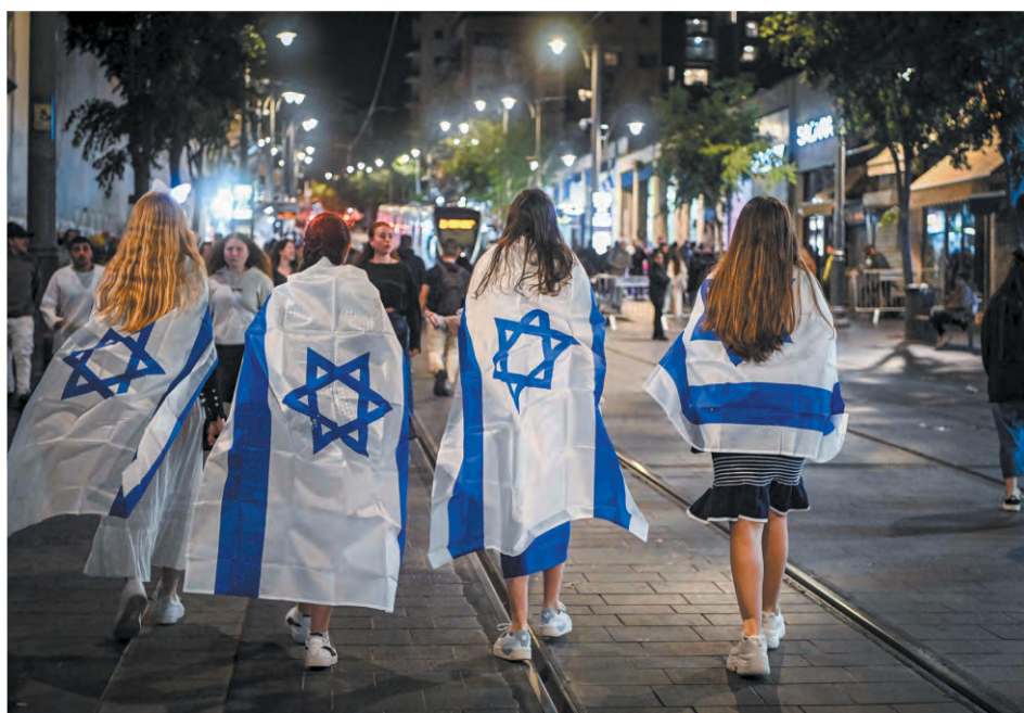
Jaffa street in Jerusalem, during Israel's 76th Independence Day celebrations, 13 May 2024.

• A currency reborn: The shekel was the coinage of ancient Israel. A half a shekel was the flat rate tax on every Jewish male; Jesus of Nazareth paid it ( Matthew 17:24-27 ). The coinage is back, known as NIS, New Israeli shekel .