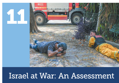
11 Israel at War: An Assessment