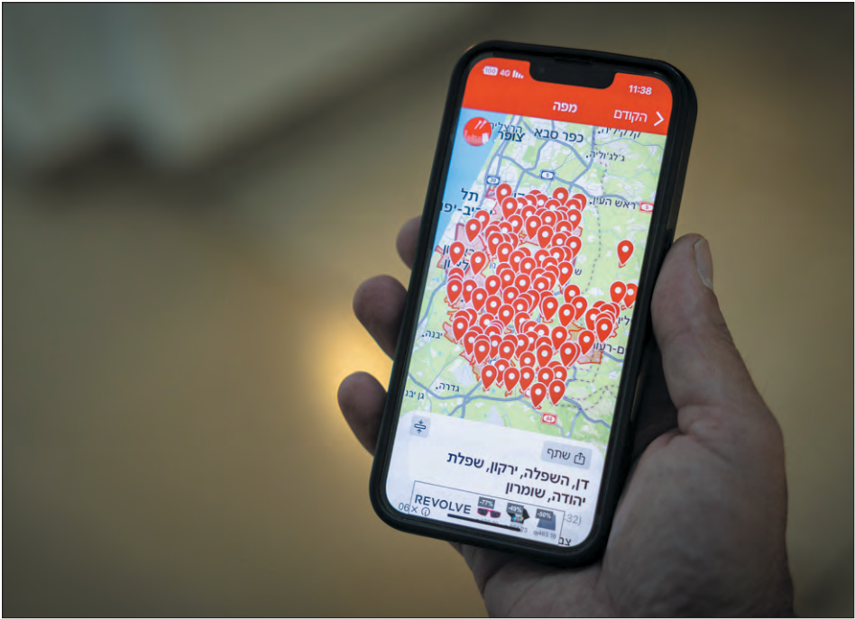
A Home Front Command app alerting of incoming rockets.

During the early part of the war, there were daily exchanges between Israel and Hezbollah along the border, precipitating the removal of 65,000 Israeli citizens from their homes in the