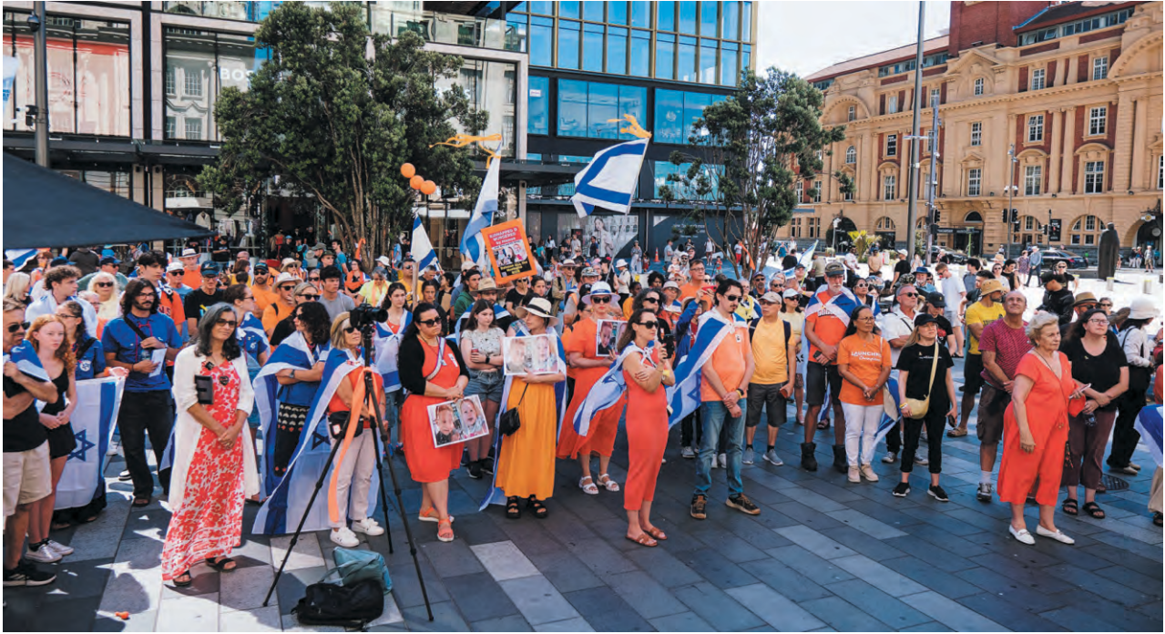
The vigil took place in Te Komititanga Square (Britomart), Auckland.

We've seen months of moral inversion. • Israel falsely accused of genocide, when it was Hamas that committed genocide on 7 October—an intentional act of war to eliminate a group of people, with a commitment to repeat it again and again and again. • The false accusation of famine— when it was Hamas commandeering the many tonnes of food supplied by Israel, starving the hostages, abusing and torturing them and preventing medical assistance. • The false accusation of targeting women and children, when it was Hamas that murdered, babies, children, women, Holocaust survivors—10-month-old Kfir and 4-year-old Ariel Bibas, strangled to death and their bodies mutilated to propagate the lie that they had been killed in an Israeli strike. And what of Shiri?