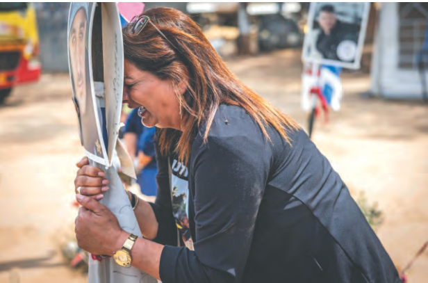
Aid for those affected by 7 October.

Many residents of kibbutzim and villages in southern Israel remain in temporary housing, often in other parts of the country. Rebuilding their homes will take time, and after 17 months, the trauma is still deeply felt. Many are uncertain about their future.