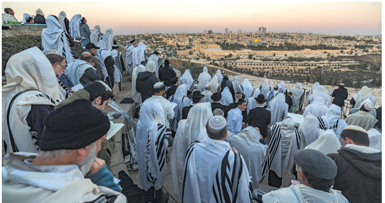
Jewish men pray on the Mount of Olives during Sukkot towards the heart of Jerusalem, the Old City with the Temple Mount.

But third, the holiest of all, is Jerusalem, the city of the great King.