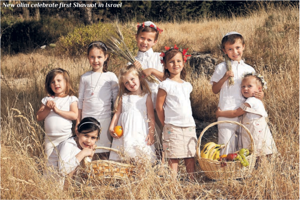
New olim celebrate first Shavuot in Israel

“The voice of the Lord strikes with flashes of lightning” (Psalm 29:7). The intense study of Torah sets man on fire, as it is told of Rabbi Ben Azzai (2nd Century). When he was expounding Scripture, fire was blazing around him. He said: “I compare the words of the Torah with the Prophets, and the words of the Prophets with the writings and the words of the Torah are as delighted as they were on the day they were given on Mount Sinai. Essentially, they were given in fire, as it is written (Deuteronomy 4:11): ‘The mountain blazed with fire.’”