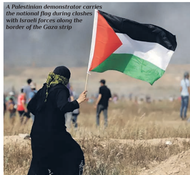
A Palestinian demonstrator carries the national flag during clashes with Israeli forces along the border of the Gaza strip

But Israel cannot be held responsible for the fact that the economic and social conditions are so bad in Gaza. Egypt also has control over the border with Gaza. And it can be argued that the Arab nations in the region which attacked Israel on 15 May 1948 ( Egypt, Syria, Jordan, Iraq and Lebanon ), should be held accountable for the plight of the Palestinian Arabs in Gaza and elsewhere, because it was their aggression ( made worse by the Six Day War in June 1967, which was also triggered by Arab aggression against Israel ) that caused the Palestinian refugee crisis.