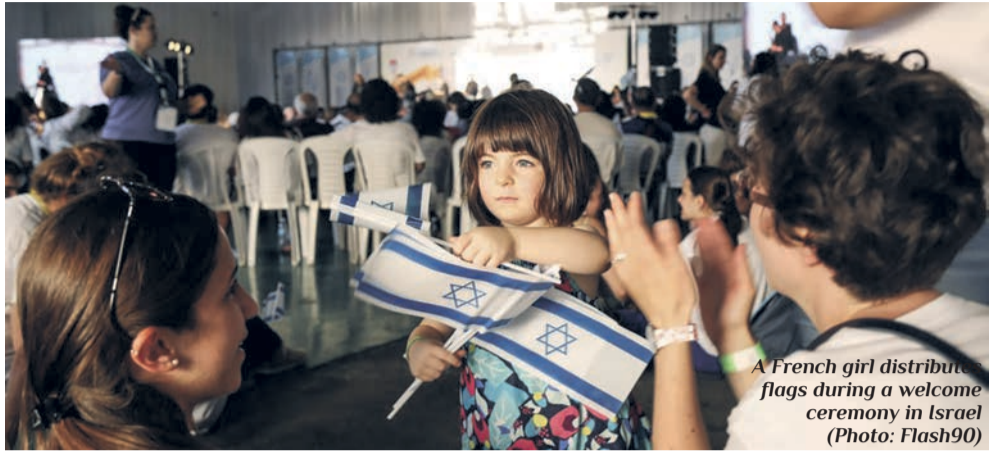
A French girl distributes flags during a welcome ceremony in Israel

The way the residents welcome the immigrants feels like a warm blanket. And that certainly can't hurt in the first twelve months of their new life.