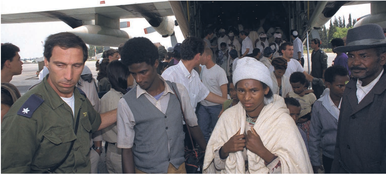
IDF officer helping Ethiopian immigrants out of the Hercules jet, Air Force Base, Operation Solomon.

It is believed that a Jewish community was already established in Ethiopia around 587BC. Although the exact origin of the Ethiopian Jews is unclear, there is widespread belief that they are descendants of King Solomon and Queen Sheba. There are many other theories as to their origins and the path that brought them to Ethiopia, but the name given to them 'Beta Israel' - 'House of Israel' - illustrates the Ethiopian Jewish community's deep connection to the Torah. Whilst there is still debate as to the Jewish heritage of the Beta Israel, the Israeli government were sufficiently convinced as to authorise the use of the IDF. The immigration of Jews from Ethiopia into Israel began in the early 1980's, following the death of some 2500 Jews in the aftermath of a violent coup. Immediately after the coup the Ethiopian government legislated to prohibit the practice of Judaism and declared the teaching of Hebrew illegal. This sparked a number of operations conducted by Israel to rescue Ethiopian Jews. Operation Solomon was the third Aliyah