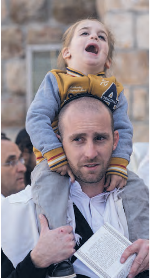
A father and his son take part in a Passover prayer service at the Western Wall.

lot in common. There is a deep connection between the two feasts. Jews and Christians are distinct, and at the same time, deeply connected.