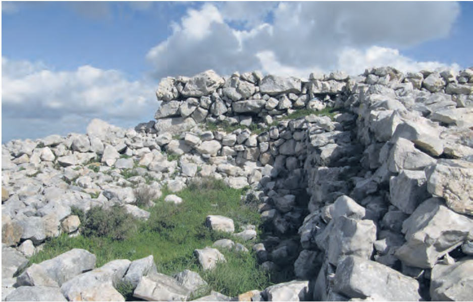
Joshua's Altar.