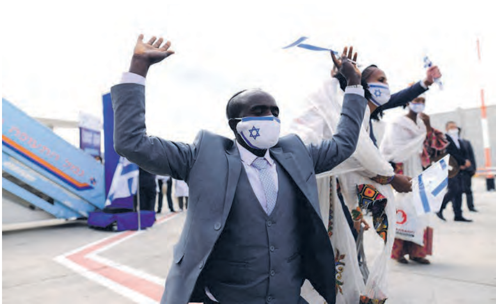
Arrival of Ethiopian olim (immigrants) at Ben Gurion Airport on 11 March 2021.