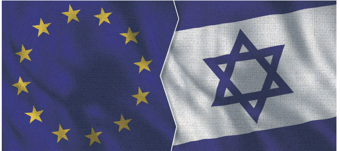
European Union and Israel flags together.

Bardaji discussed several factors giving rise to these and