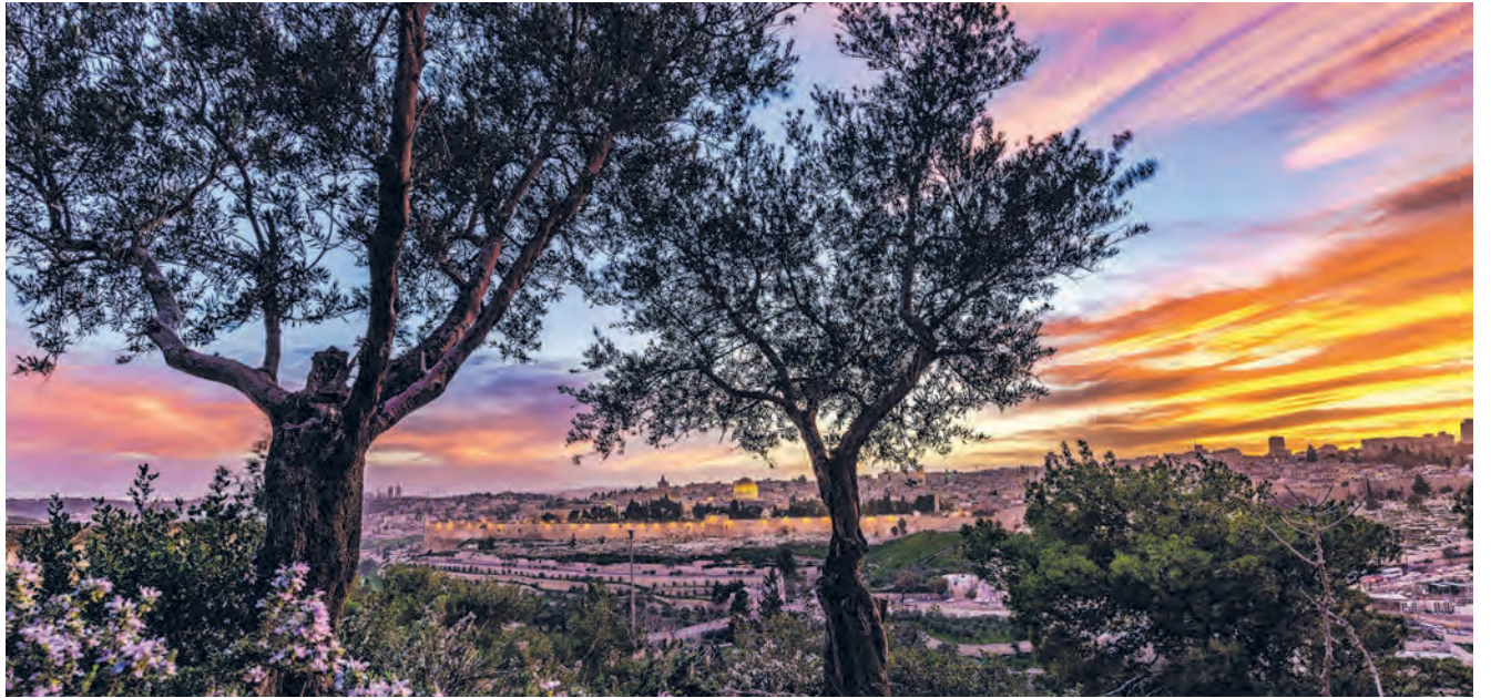
Sunset over Jerusalem in spring as seen from the Mount of Olives.