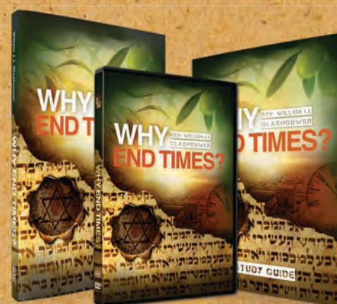
Why End Times? Book, DVD and Study Guide

Order on the coupon on the back page or online www.c4israel.org.nz