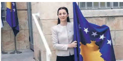
Kosovo opens embassy in Jerusalem, following the US and Guatemala