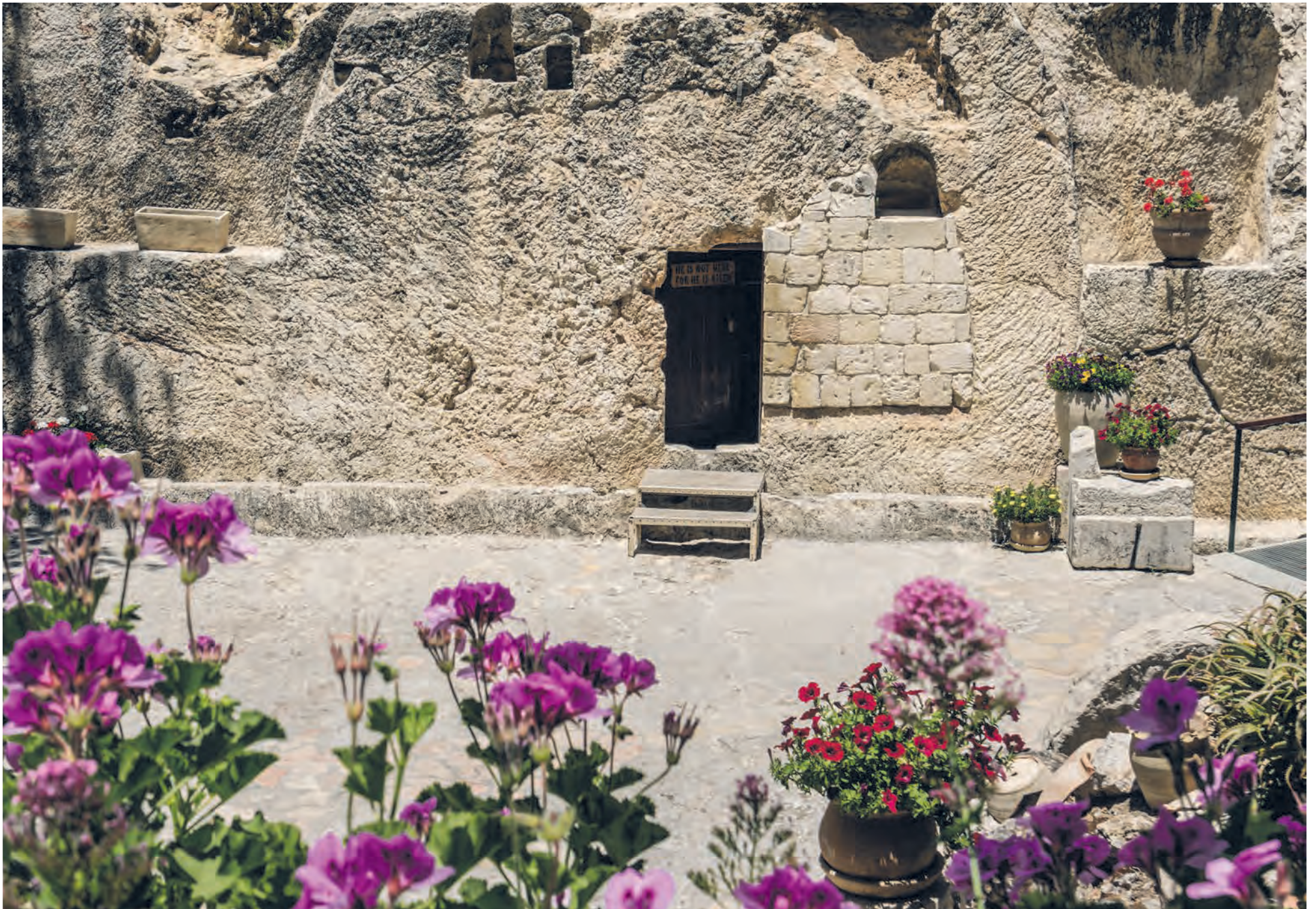
The Garden Tomb in Jerusalem.