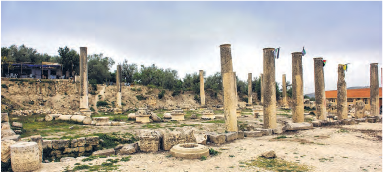
Herod the Great Palace in Sebastia, Samaria.

On the surface, CHC looks like one and the same region, especially since the hills are nearly all made of limestone, but there are distinct variations that have affected