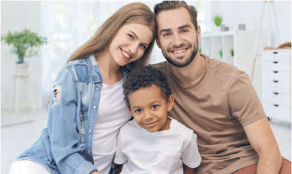
Young boy with his adoptive parents.

legal case for the actual legal transference of the person to be adopted into his own Potrea Protestus . And when all this was complete the adoption was done. Now there were four main consequences in a Roman adoption. The adopted person lost all rights in his own (natural) family and gained all rights in his new family. He gained all the rights of a fully legitimate son in his new family. Secondly he became full heir to his new father’s estate even if there were other sons, even if there were no sons, if other sons were afterward born into the family who were real blood relations it did not affect his right of progenerate, his right to be the primary one. He was an inalienably identified heir. Thirdly, according to Roman law, the old life of the adopted person, this is interesting, was completely wiped out. If he had any debts they were cancelled, if he had any record of crime it was abolished. They wiped out all the records as if that person had never existed, as if they had never been born. And the adopted person was regarded as a new person entering a new life with no past. And fourthly in the eyes of the Roman law the adopted person was literally and absolutely the son of his new father in every sense.” Isn’t remarkable! This is a natural picture of the exact process that takes place in our relationship with God when we come to