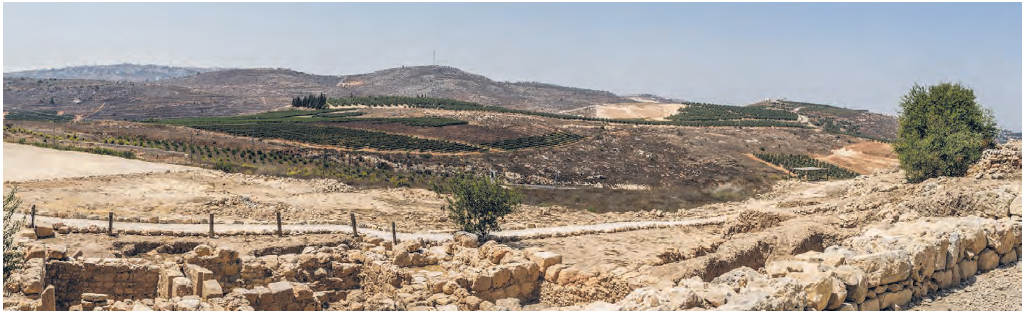
Panoramic view from the archaeological park of Shiloh in Samaria, Israel.

The famous Biblical city of Shechem is located here. Mentioned 63 times exclusively in the Old Testament - Shechem really is the ‘navel’ of the Samaria. Sandwiched between Mount Ebal (940m), the ‘mountain of cursing’ on the northside, and Mount Gerizim, the ‘mountain of blessing’ (881m) on the southside, Shechem is important in Genesis, Joshua, Judges, and 1 Kings. Nearby eastward is Sychar, the location of Jacob’s Well, where Jesus first revealed Himself as Messiah to the Samaritan woman at the well in John 4. Down the road from Shechem