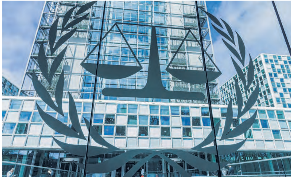
The International Criminal Court in The Hague, Netherlands.

Aware of how controversial the question of Palestinian statehood is, in early 2020, the Prosecutor asked the Court to confirm whether, in fact, she has the authority to investigate the alleged