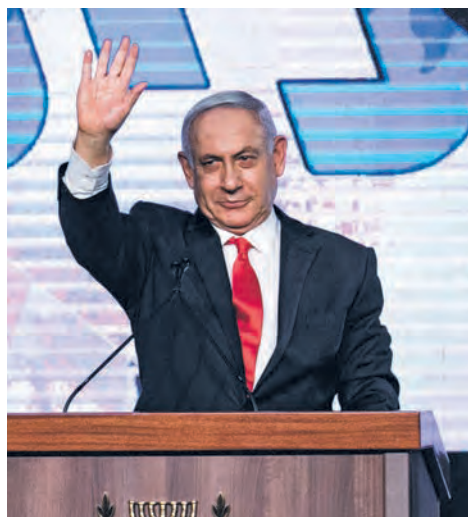
PM Netanyahu addresses his supporters on the night of the Israeli elections.

Another key player is Naftali Bennett's Yamina party that has probably achieved seven seats (much less than expected). Bennett could end up becoming the 'kingmaker' deciding whether or not Netanyahu returns as Prime Minister. He has not ruled out working with Netanyahu. Former hi-tech whizzkid Bennett is widely regarded as a possible successor in the future to Netanyahu as Prime Minister.