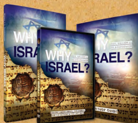
Why Israel? Book, DVD and Study Guide