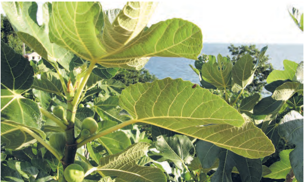
Fig tree.

A hundred years ago, Jerusalem was nothing but a little village town with thirty-eight thousand inhabitants – unhygienic, flea-bitten, fly-blown, half-ruined, the capital of nothing, buried in the Judean hill country in the Syrian province of the Ottoman Empire. Why would nations come against Jerusalem? There is no oil, gas, coal, natural resources, and very little water. Why would they come against this little postage stamp of territory? But today, everybody understands. There have been six wars in the past decades, and they have all been over Jerusalem. Suddenly, something has happened that has changed the whole scene. Seemingly, from the ashes, like the phoenix, she has risen from the dead and occupied the centre of the world’s stage. Now we understand the prophet Zechariah when he said that one day the Messiah’s feet will again stand upon the Mount of Olives, and from this, we understand the fig tree is very much alive and back in its original territory. The sign is there, and at the same time, there have been two world wars that have