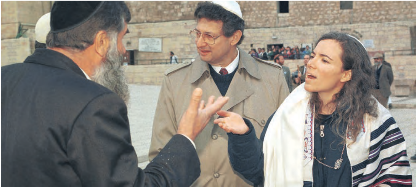
An orthodox Jewish man argues with a reform Jewish woman wearing a prayer shawl at the Western Wall. Reform judaism is the most liberal form of modern Judaism, being the only ones who allow women to wear the prayer shawl.

It's like riding on a never-ending roller coaster. Pressing