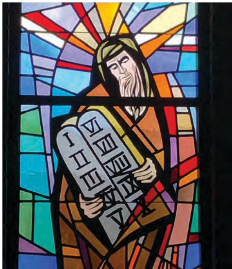
Stained glass image of Moses and the Ten Commandments.

All these covenants define a special, exclusive and binding relationship between God and Israel.