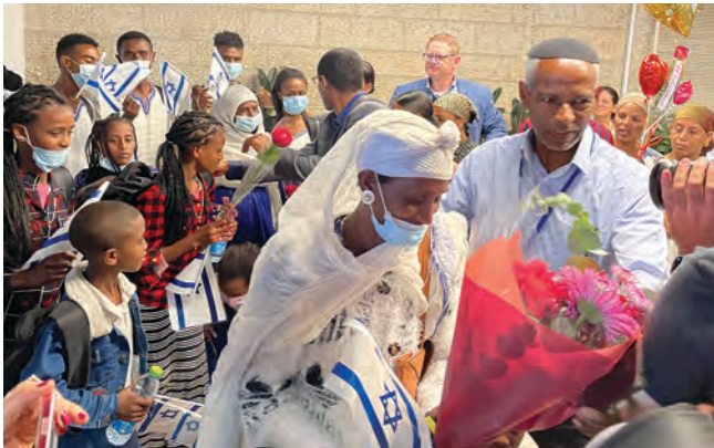
Ethiopian Olim after arriving in Israel.

Since the establishment of the State, 95,000 Ethiopians have emigrated to Israel with the help of the Israeli government and The Jewish Agency. In the mid-1980s, approximately 8,000 immigrants arrived through Operation Moses through Sudan. In 1991, 14,000 immigrants arrived as part of Operation Solomon. In the summer of 2013, The Jewish Agency completed its