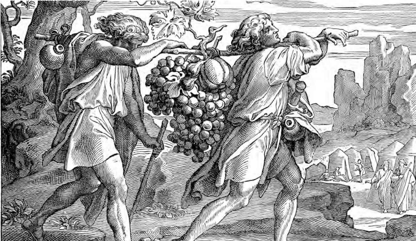
Artist's impression of the Spies Returning from Canaan, Numbers 13-25

God’s people were terrified at the very thought of entering the land. Although it was clearly a land of much blessing (milk, honey, grapes), the people’s focus was on their own welfare and comfort rather than the call of God