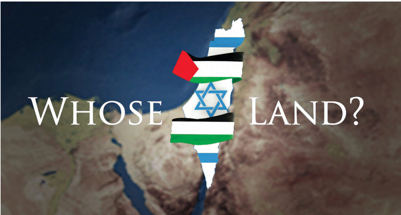
Watch episodes online: c4israel.com.au/whose-land

Unknown to the War Cabinet, at the very time they were meeting in Whitehall, the Allied forces had captured