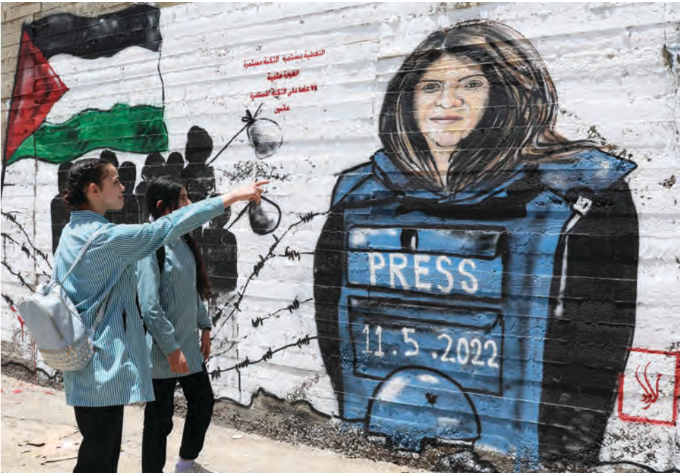
Mural for Al Jazeera journalist Shireen Abu Akleh who was shot and killed on 11 May 2022.

Media Investigation Several media outlets (official and alternative) have published investigations since the incident, providing evidence to either prove that the IDF was responsible for Abu Akleh’s death or not. Pro-Israel blogger ‘Elder of Ziyon’, for example, regularly wrote blog posts in which he provided new material which