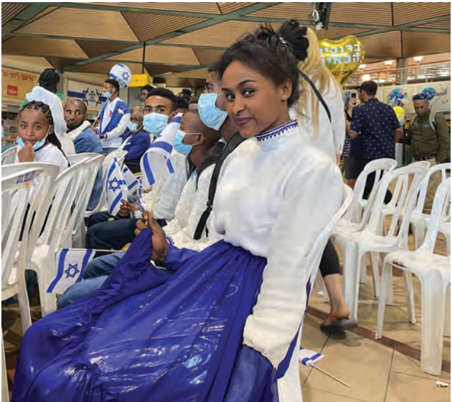
Ethiopian young woman especially dressed in blue and white for her Aliyah.

Can you tell us something about the yearning of Ethiopian Jews to come to Israel?