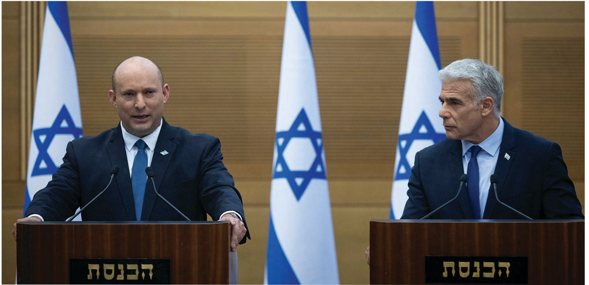
Israeli prime minister Naftali Bennett and Foreign Minister Yair Lapid hold a joint press conference at the Israeli parliament in Jerusalem on 20 June 2022.