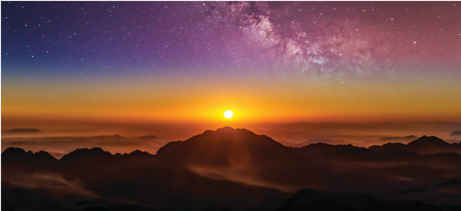
Panoramic view from Mt Sinai, Israel.