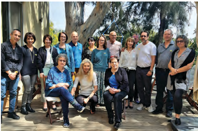
Mairants family reunion in Israel.