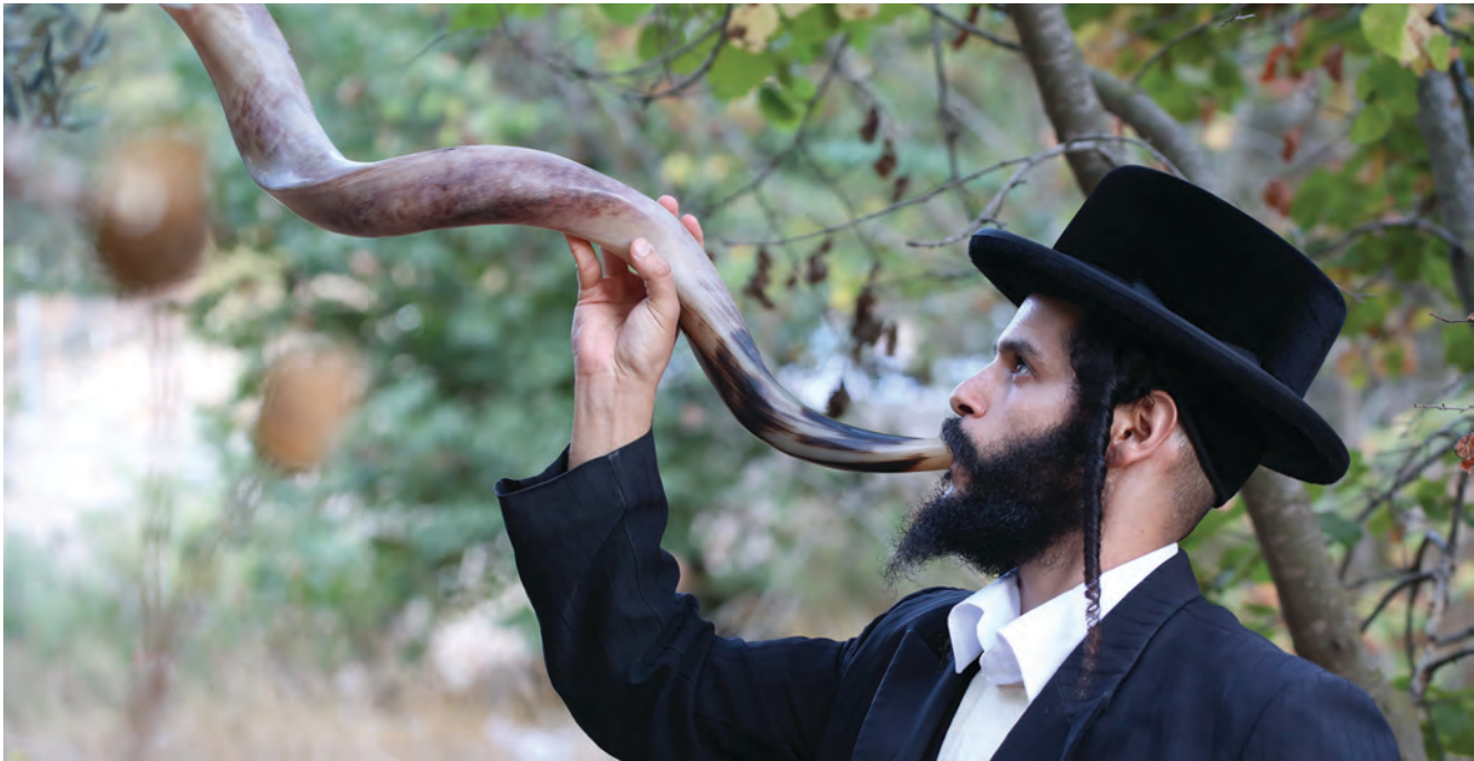
Orthodox Jew blows a long Yemenite shofar for Rosh Hashanah.