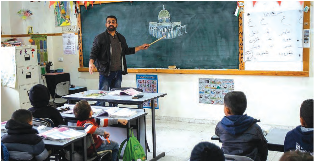
A Palestinian class at the Salem School, East Jerusalem (illustrative).

Amongst other issues, IMPACT-se discovered that study materials present Jews as ‘devious, treacherous and hostile’ people who control ‘global events through financial power.’ Furthermore, students are taught that one of the ‘rules of jihad’ is to die as a martyr while killing infidels and that they should sacrifice themselves for their homeland and ‘redeem it with blood.’