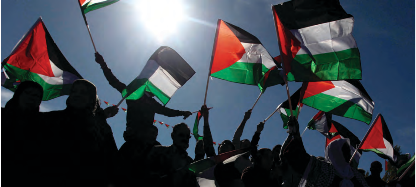
Palestinians wave their flag during a celebration rally marking the UN General Assembly’s upgrading of the Palestinians’ status from ‘observer entity’ to ‘non-member state’, in the West Bank city of Ramallah. 2 December 2012.

It is, of course, a principle of international law that peoples have political rights to independent self-government. However, the legal principle of self-determination does not prescribe specific forms or structures for self-government. There will be different