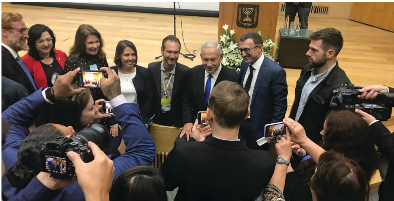
The surprise visit of former Prime Minister Benjamin Netanyahu.