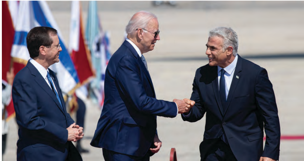
US president Joe Biden, Prime Minister Yair Lapid and Israeli president Isaac Herzog at the welcoming ceremony at Ben Gurion Airport on 13 July 2022, for his first official visit to Israel.

Next, there is the problem of Iran. In an interview on his first day in Israel, Biden