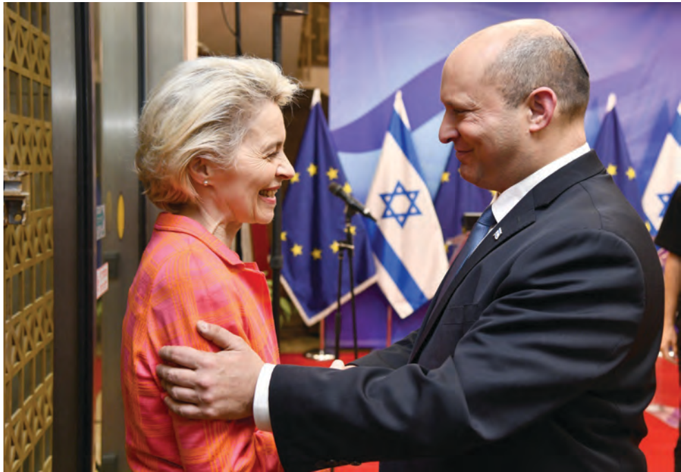
Israeli PM Naftali Bennett meets with European Union Commission President Ursula von der Leyen at the Prime Minister’s Office in Jerusalem, on 14 June 2022.

The Eastern Mediterranean, as a whole, including Israel, has immense gas reserves that have been estimated to reach 10.8 trillion cubic meters of gas or roughly 5 per cent of the world’s gas reserves. This amount of gas has been estimated to be roughly equivalent to 76 years of gas consumption by the EU.